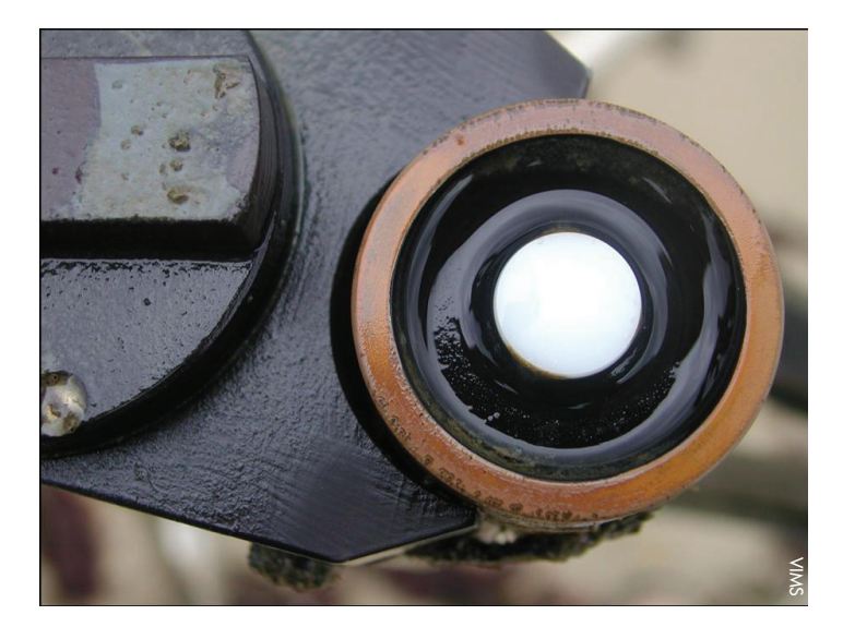
Figure 5. Wiped PAR sensor after 8-day deployment.

Tel.+1 508 748 0366 US 800 363 3269 Fax +1 508 478 2543 environmental@ysi.com www.ysi.com