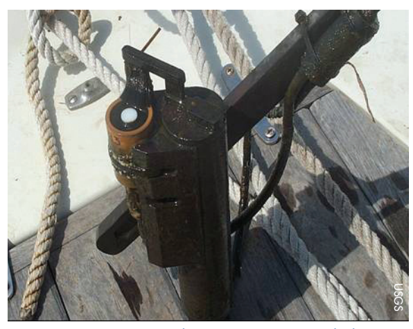
Figure 2. A YSI PAR wiped sensor system prior to deployment

Field studies such as those performed by Virginia Institute of Marine Science (VIMS), National Estuarine Research Reserve, the National Park Service and the USGS demonstrate that the Endeco/YSI Wiped PAR sensor system prevents fouling of the LI-COR sensors, even in high fouling environments (Figure 3). Figure 4 presents PPFD data from two PAR sensors deployed by VIMS using the 6600EDS wiped PAR system. The wiper was disabled on one the lower sensor and enabled on the upper sensor. Data depict the remarkable advantage of the Endeco/YSI Wiped PAR system. Compare the physical condition of these sensors after a 8-day deployment (Figures 5 and 6).