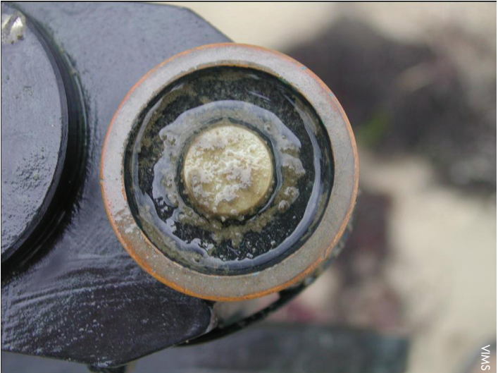
Figure 6. Non-wiped PAR sensor after 8-day deployment.